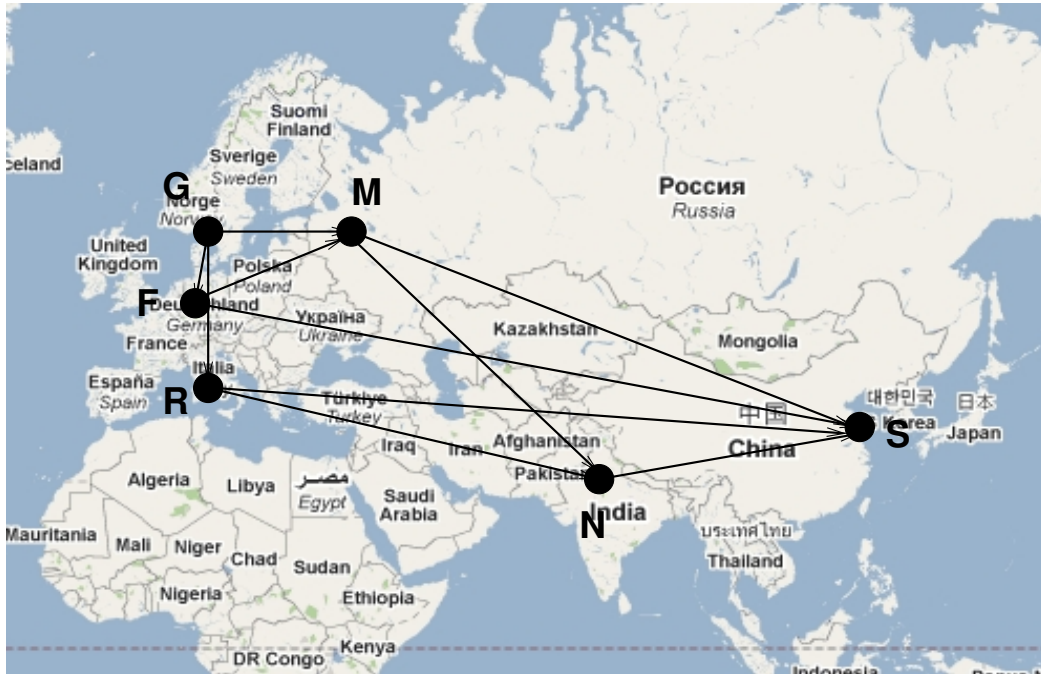
Figure 2: (Exercise 3)